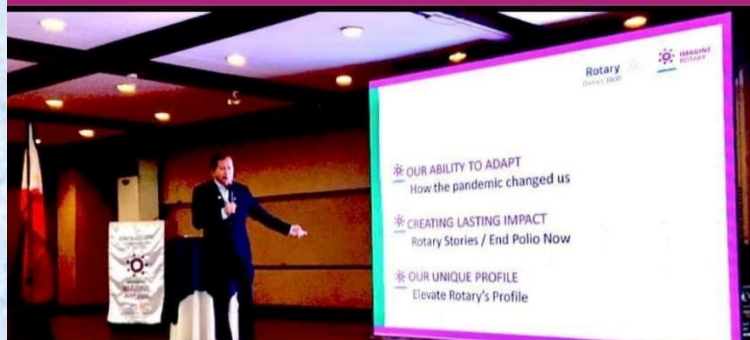
RCPS Host RI District 3800 Strategic Planning & District Team Training 2022