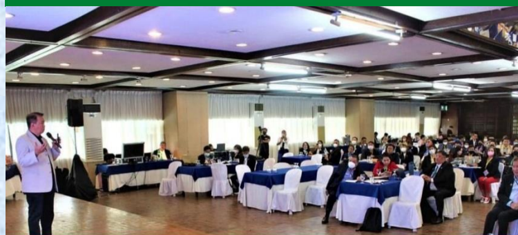
RI District 3800 Strategic Planning & District Team Training 2022

March 5, 2022 / Valle Verde Country Club