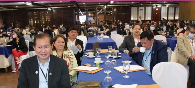
RI District 3800 Strategic Planning & District Team Training 2022 March 5, 2022 / Valle Verde Country Club