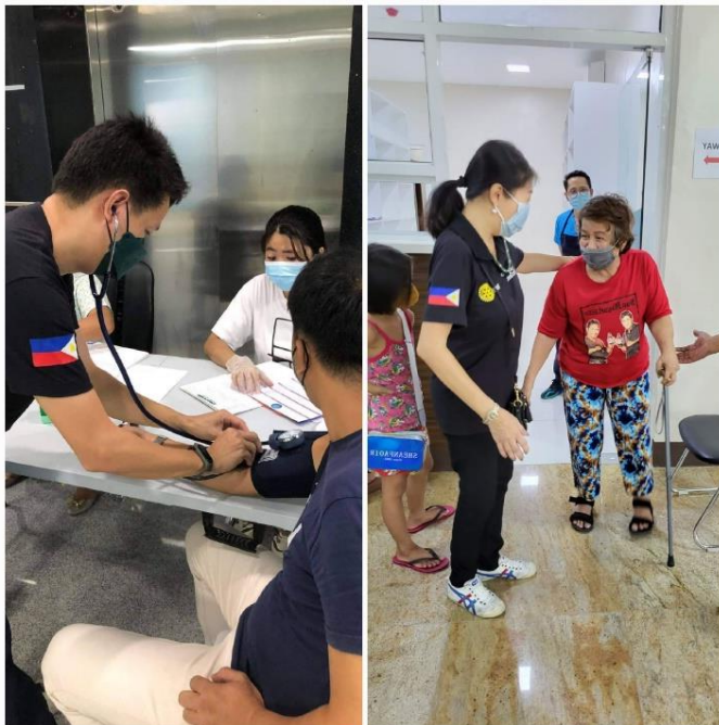
"Musta Doc – Libreng Konsulta at Gamot, ang aming sagot"

These service projects, which focused on Maternal and Child Health and Disease Prevention and Treatment, benefited a total of 208 beneficiaries composed of Malabon and Navotas residents.