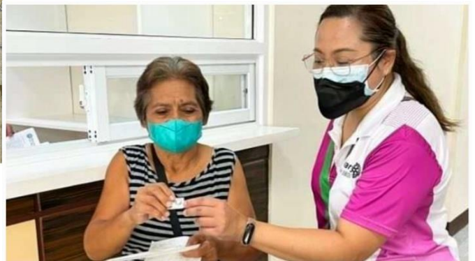
"Check your Matres, mga ka-Marites"