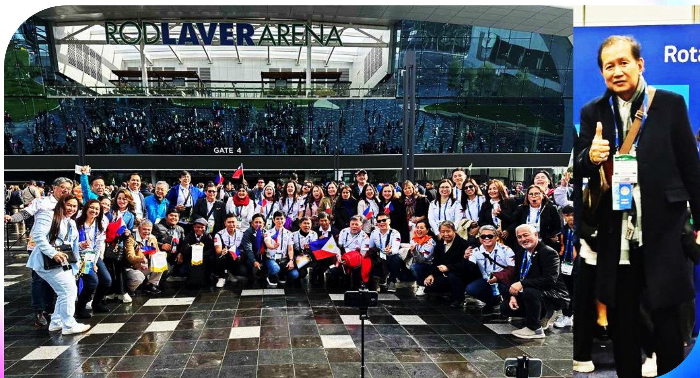
PART OF THE PHILIPPINE CONTINGENT FROM RI D3800 WITH DG ARTURO "BOBBY" TANYAG WHO ATTENDED THE RI CONVENTION IN MELBOURNE, AUSTRALIA LAST MAY 27-31, 2023

District Governor, RI D3800 RY 2022-2023